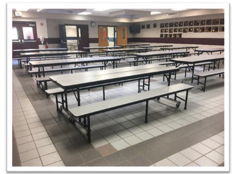
The commons area and overflow dining area lacks proper ventilation.