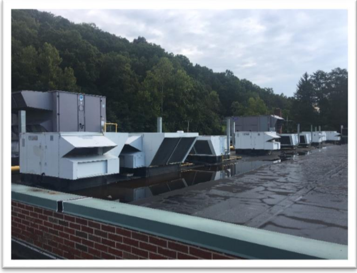
The existing roof top units do not provide adequate air exchange.