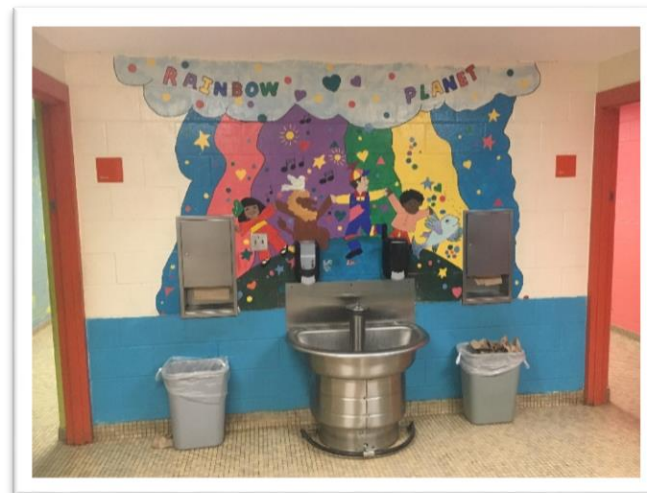
The existing gang sink area between restrooms throughout the school are not handicapped accessible.