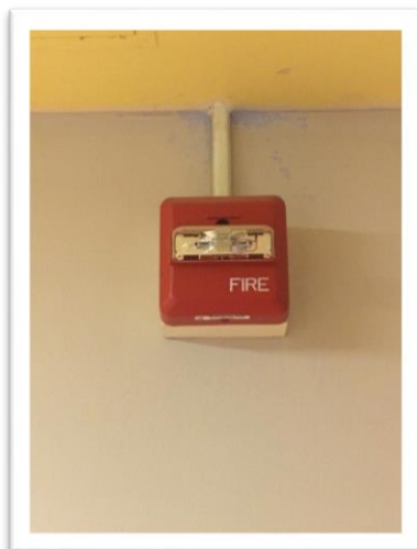
Typical outdated fire strobes will be replaced with the proposed fire alarm system upgrades.