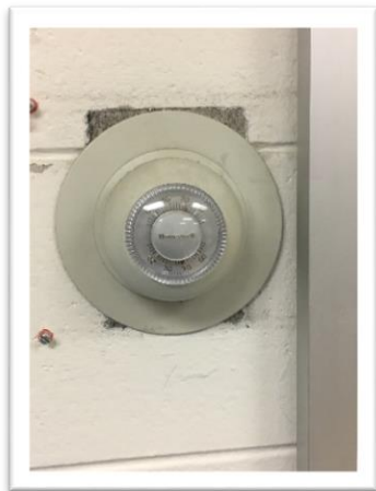
Residential style thermostat controls are to be replaced with integrated Direct Digital controls throughout the facility.