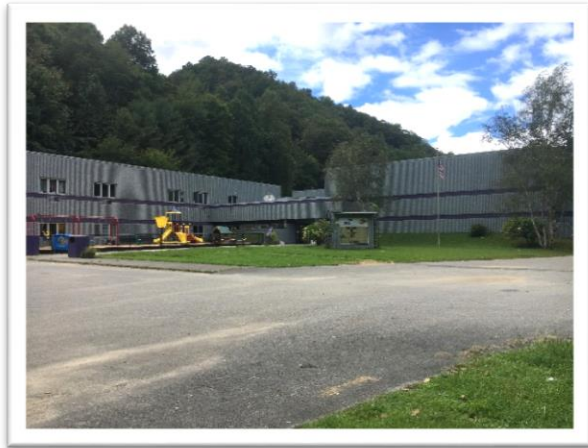
The main entrance to Gilbert PK-8 is shown after Phase I Modifications.