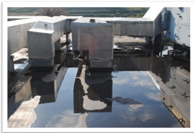
The roof experiences severe ponding water around roof top units and duct work.