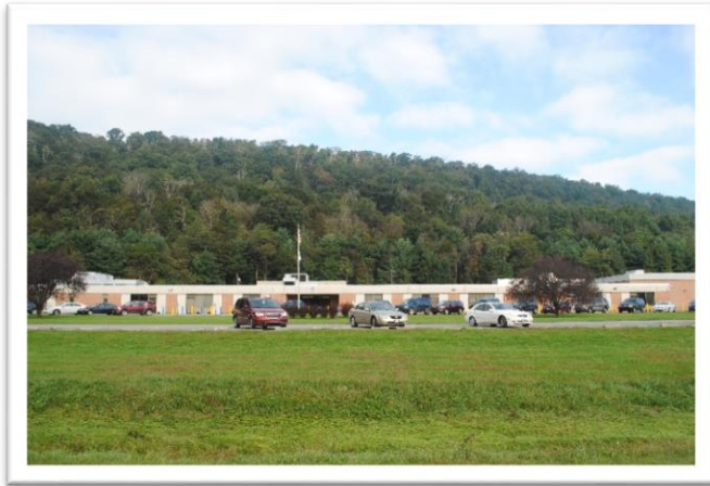
Widmeyer ES which is prominent in the community as seen from Rt.522.