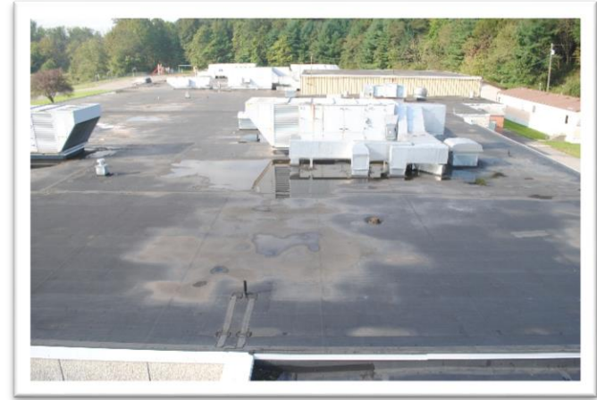
The main roof looking toward the south shows areas of ponding water and deteriorating seams.