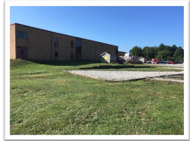
This shows the area of proposed addition at the rear of the facility adjacent to the football stadium.