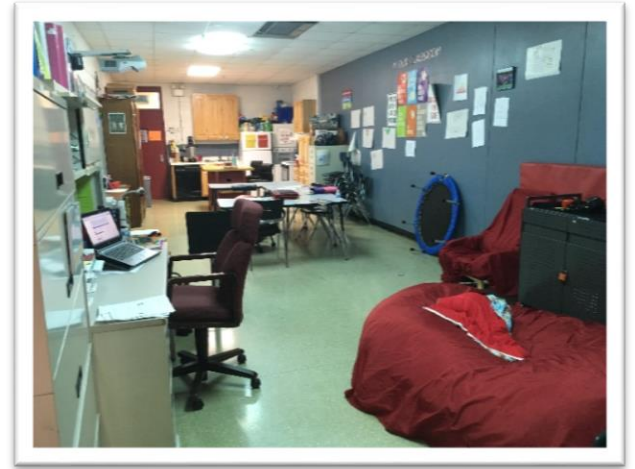
Another view of the current special needs spaces that are proposed to be replaced.