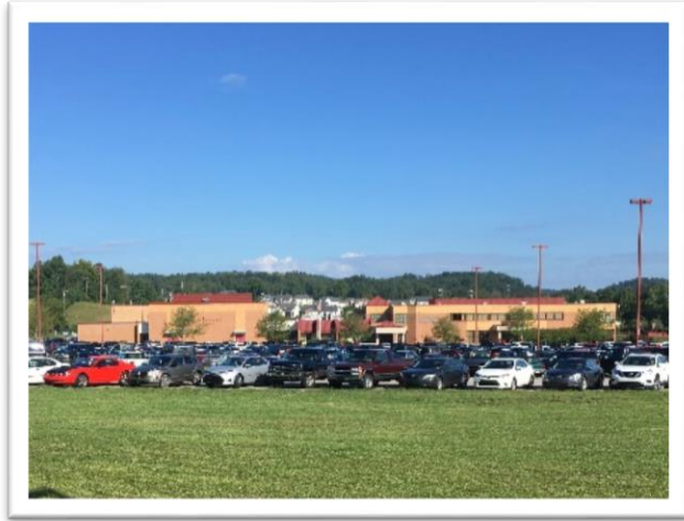
Hurricane HS, located on Rt. 60, is overcrowded and is at maximum capacity.