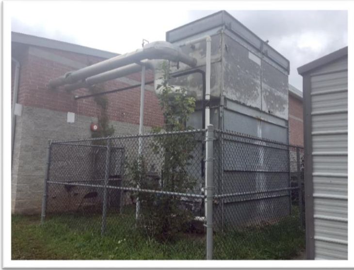
The maintenance personnel are concerned that only corrosion is holding the cooling tower together.