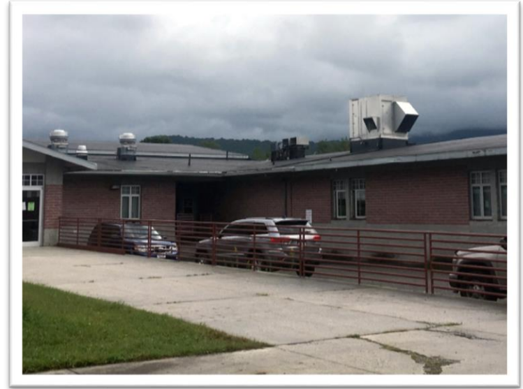
The aging roof shows seam separation, soffit, and flashing issues.