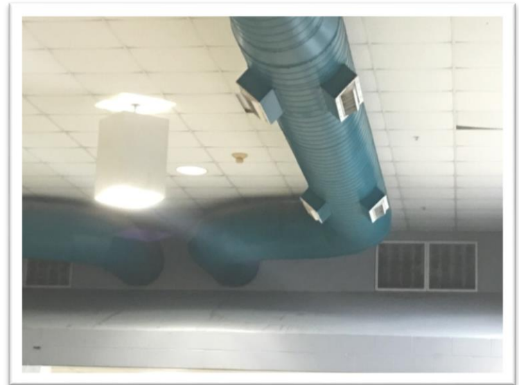
The vents and lights in the two-story dining area are too difficult to clean, replace, and service.