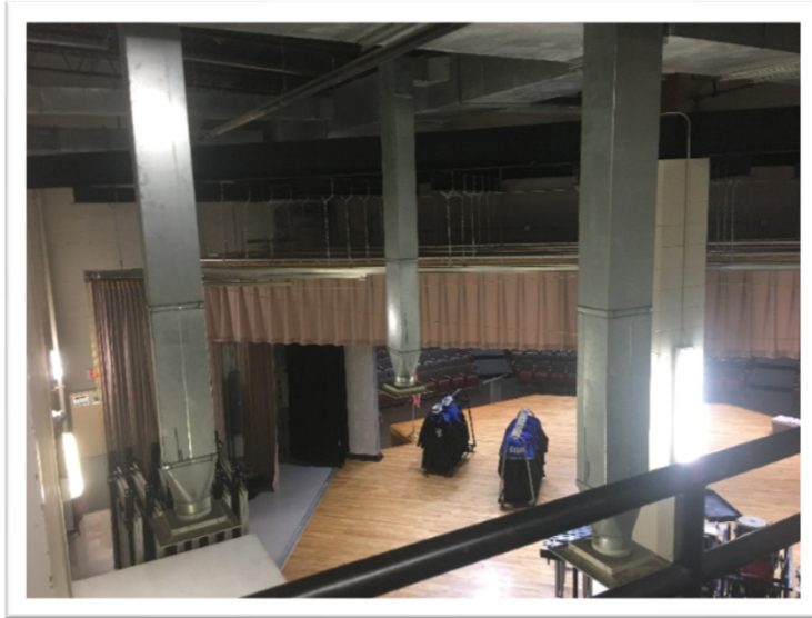
Upgrades are planned for the auditorium and stage where inefficient ductwork and lighting are hanging from the ceiling.