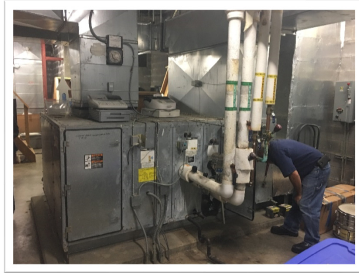
The project proposes to upgrade equipment that is past its life-expectancy for the classrooms, auditorium, band, music, and an office suite.