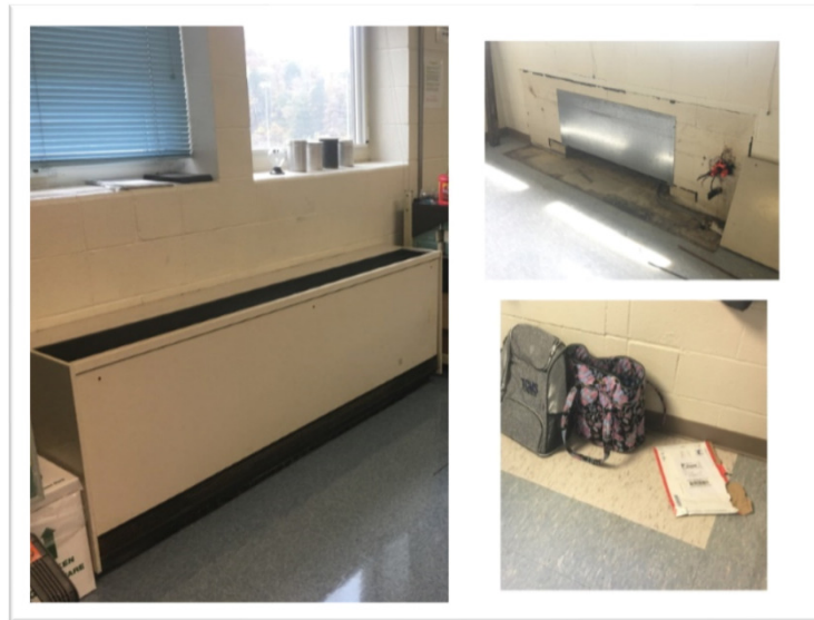
This project will remove unused unit ventilators in classrooms on the second floor.