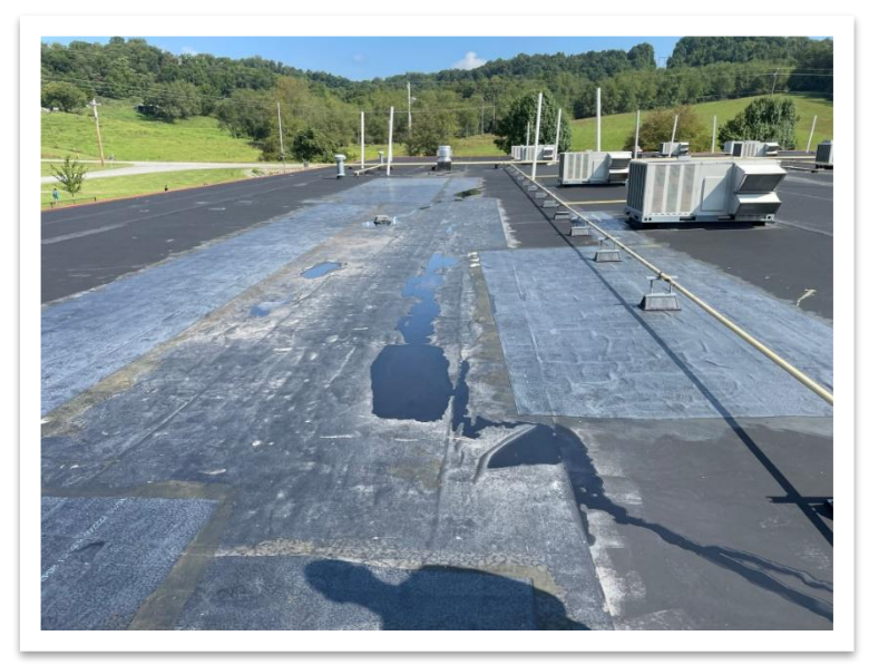
Large patches on roof to fix leaks.