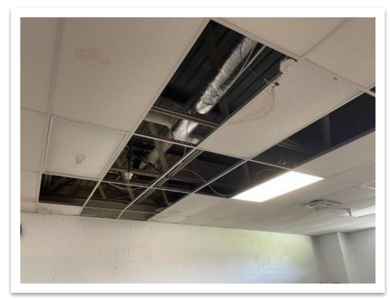
Damaged tile in classroom where maintenance personnel are tracking gutter and downspout failure.