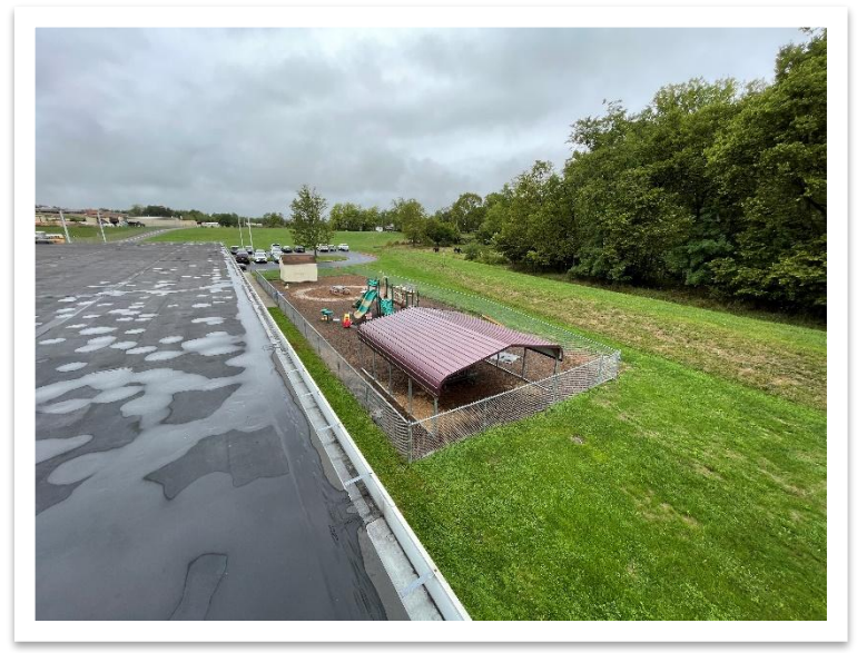
The Future site of addition and playground will simply move into site green space along building.