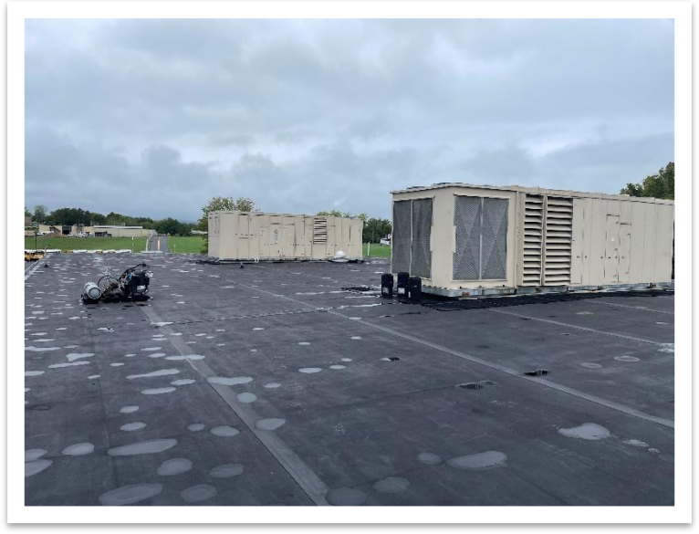
Mammoth roof top unit showing ongoing replacement of compressors. Replacement parts are becoming obsolete.