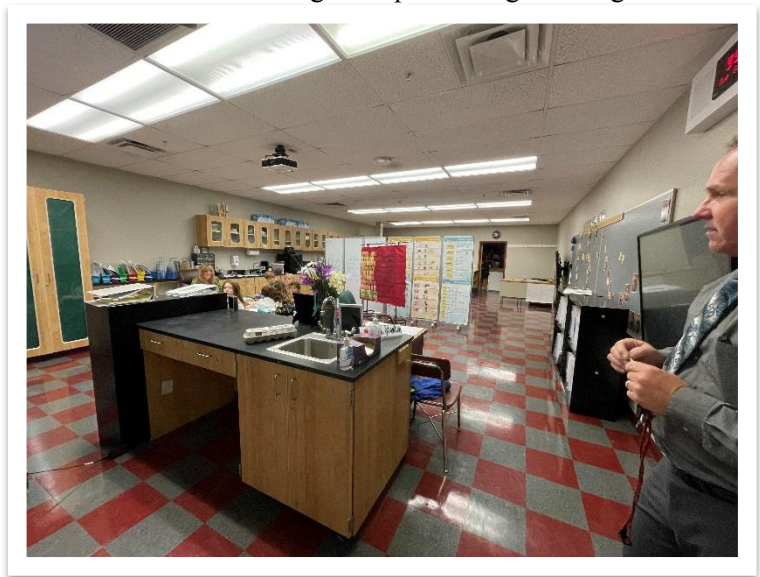
The science classroom and computer lab have been repurposed.