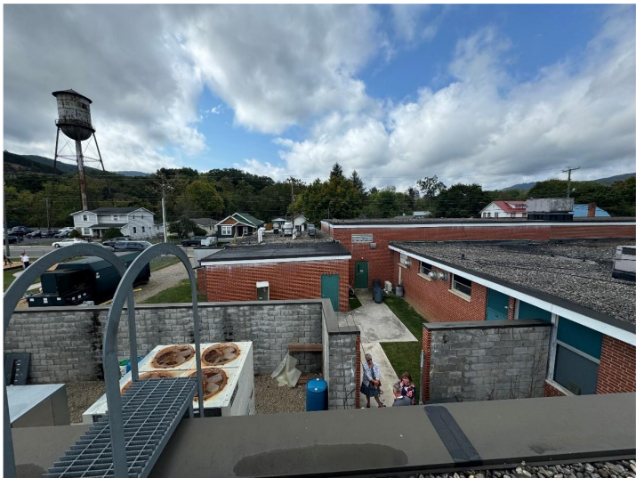
The project includes new HVAC equipment and replaces the ballast (gravel) roof with a new EPDM roof.