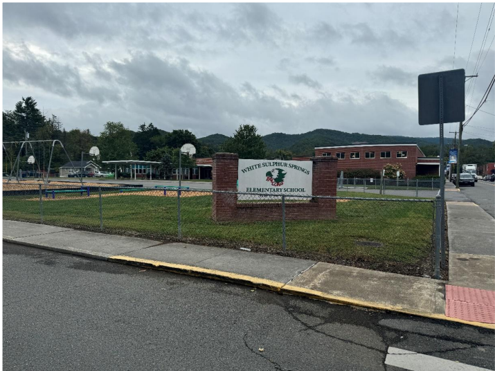
Site in front of school for the addition of the office, multi-purpose room and on-site parking.