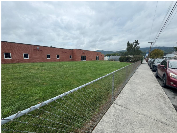
The playground will relocate to the side of the building with a higher fence for security.