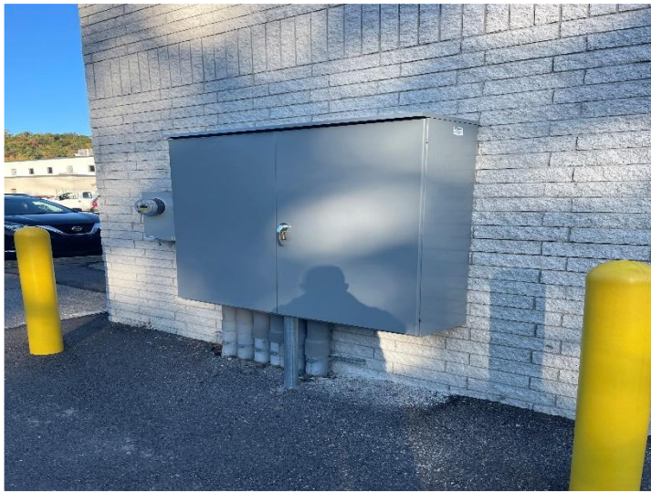
Jackson county has already spent $3.6 million renovating the HVAC and electrical system at this facility.