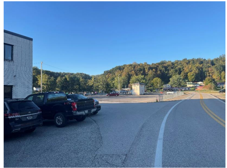
Location of the new gymnasium. Existing gymnasium will be renovation to serve as the cafeteria/kitchen area.