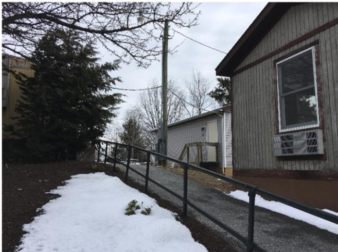
The portables/ annex buildings at Ranson Elementary School are cited by the state Fire Marshal for failing fire alarm testing.