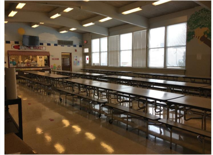
The cafeteria at Ranson Elementary has been cited for not having fire-rated separation at the openings to kitchen.