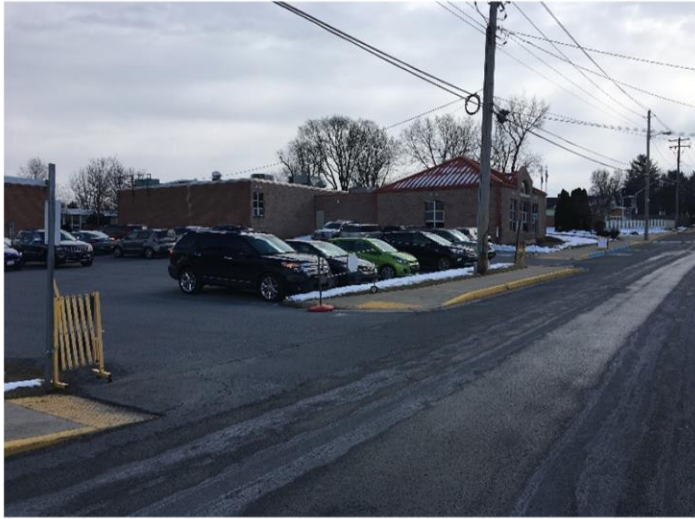
Traffic circulation and parking at the existing Ranson Elementary is limited and unsecure.