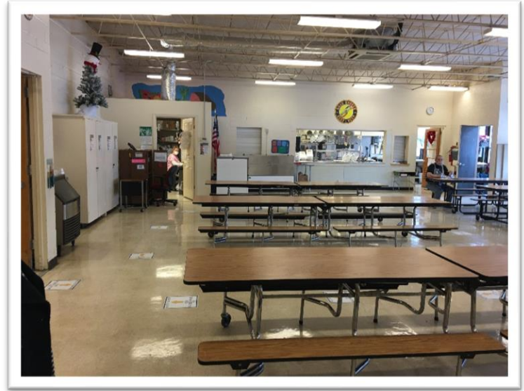
The kitchen is undersized, and the office is a small room carved out of the cafeteria due to lack of space.