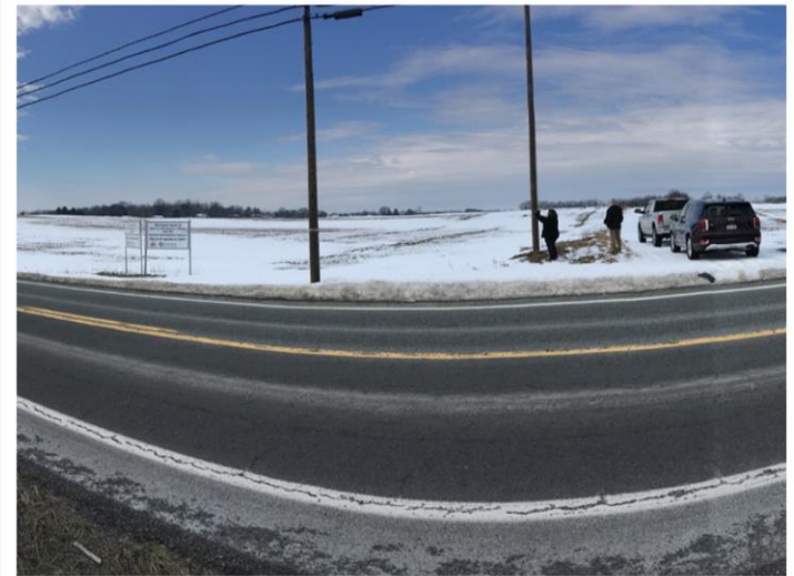
Site of the purchased property along WV Route 9 with signs posted for the future Ranson Elementary school.