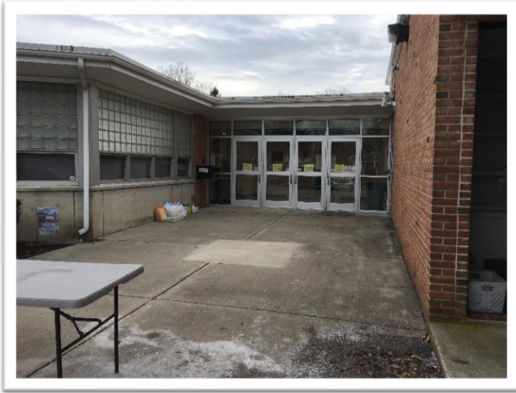
Shepherdstown Elementary School's entrance is located away from the main office.