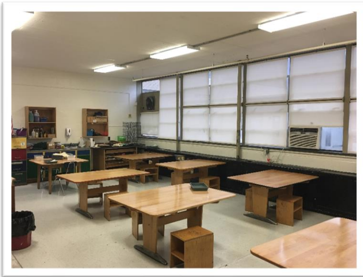
The existing classrooms will be renovated with new windows, HVAC, lighting, and new suspended ceilings.