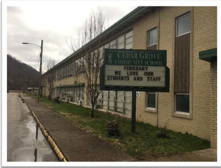
The existing two-story academic wing that will remain and be renovated.