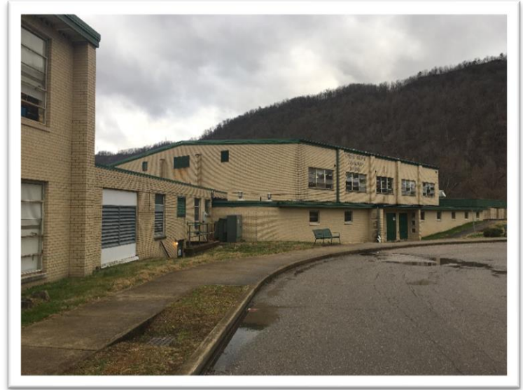
The existing gymnasium will be demolished, and a new physical education addition will be constructed.