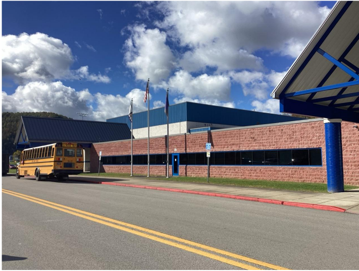
Proposed location of a canopy to bridge the two front entrances of Lewis County High School.