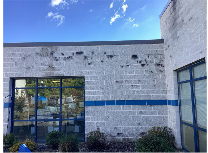
The exterior block of the building to be thoroughly cleaned and sealed.