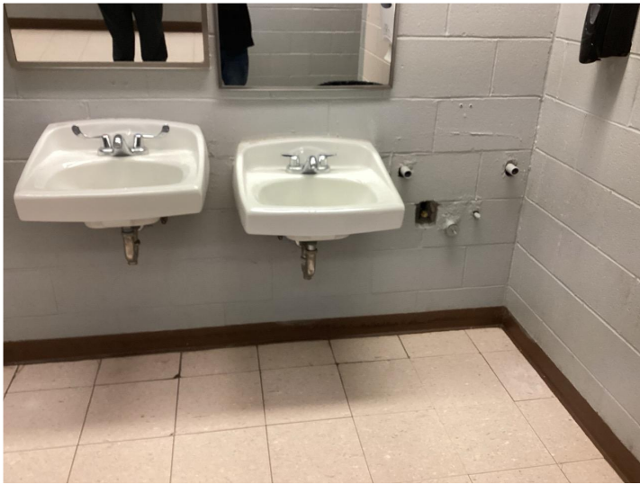
Restoration to the restrooms include new flooring, fixtures, and improved toilet accessories.