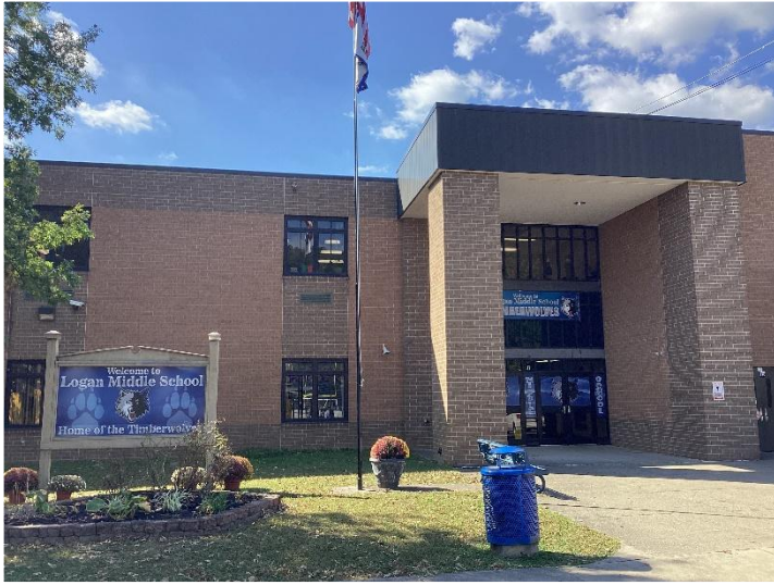
Logan Middle School (1997)