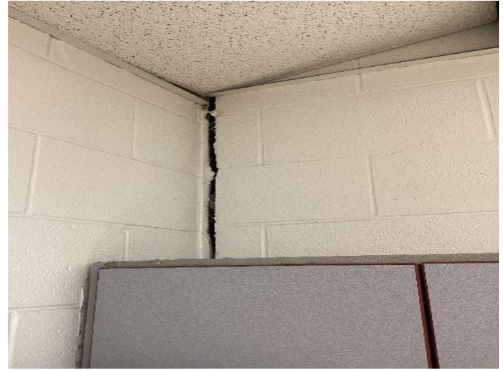
One of several areas within the school showing significant signs of cracking from settlement.