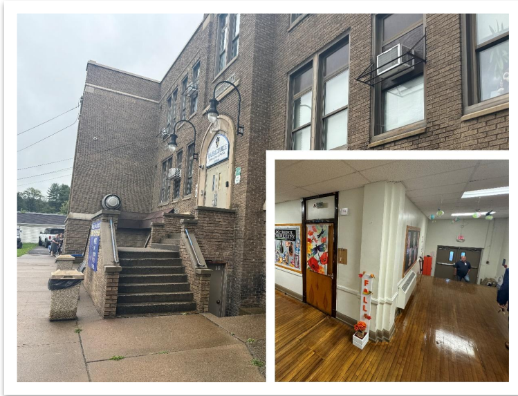
At Barrackville ES, the stairs will remain to access the new main office.