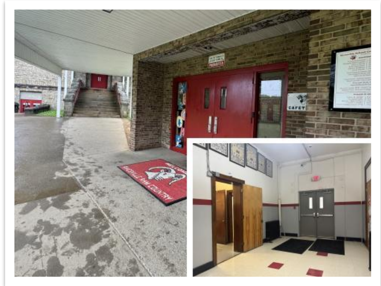
At Rivesville MS, the stairs will remain to access the new main office. Cafeteria and gym buildings will still be exposed spaces.