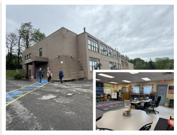
At Pleasant Valley ES, the office will move to the end of the building where vehicular pick-up already occurs.