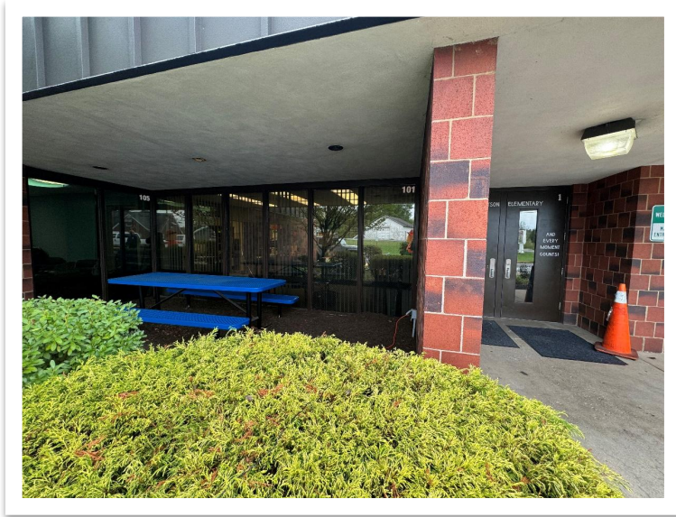
At Watson ES, the new safe school entry will be an addition along the row of glass windows of the main office.