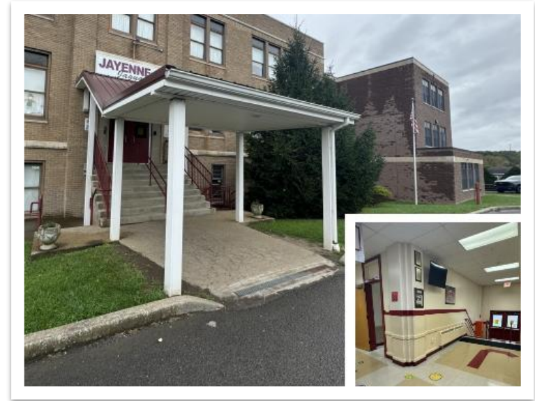
At Jayenne ES, interior and exterior stairs will remain to access the new main office.