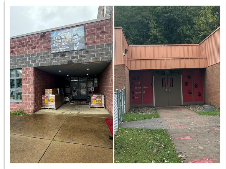
At Blackshere ES and Monongah ES, the plans are to change adjacent classroom at entry to office space.