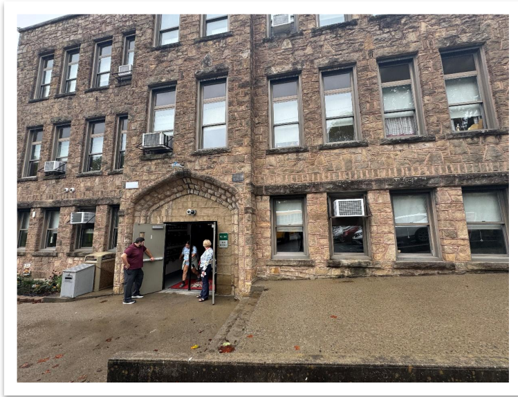
At Fairview MS, the office will move to the end of the building where vehicular pick up already occurs.