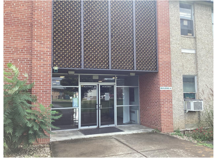
Existing secondary entrance to be renovated into new safe school main entrance to the facility.