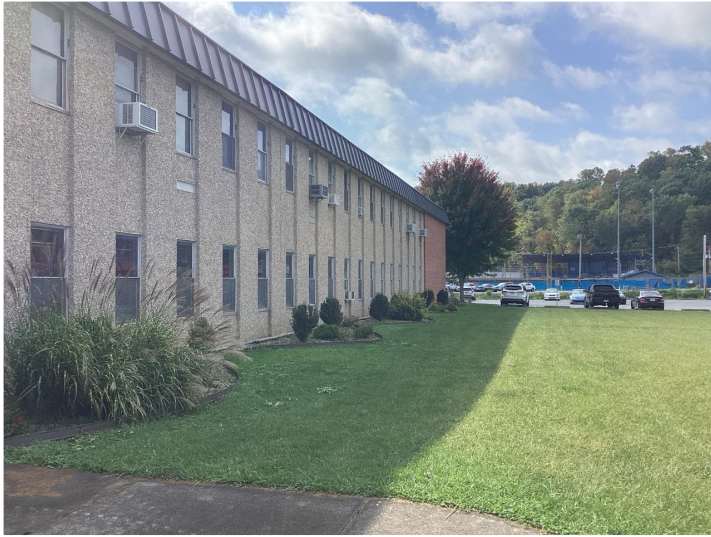
Proposed site of the new addition, located within existing greenspace of the campus, adjacent to new main entrance.