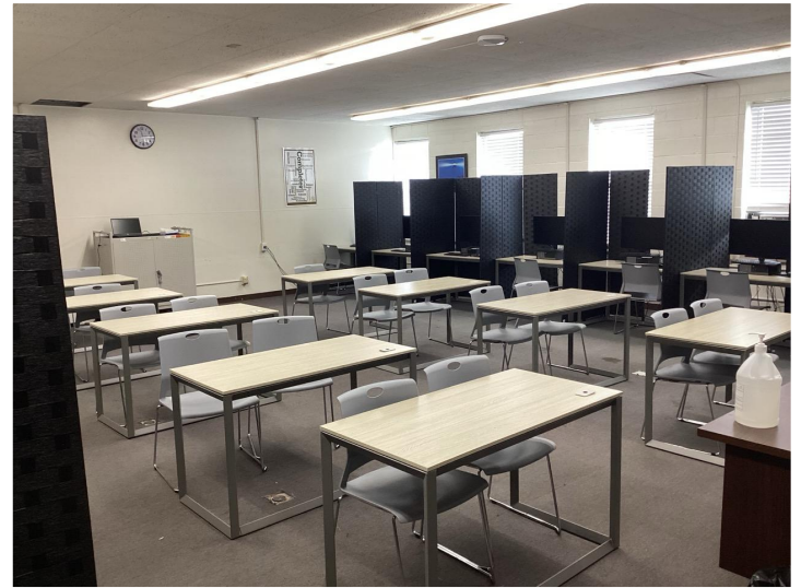
Testing lab currently being used to house students in the healthcare program due to lack of available space.