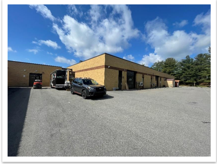
The nearest garage door and pedestrian door will be covered by the proposed addition.