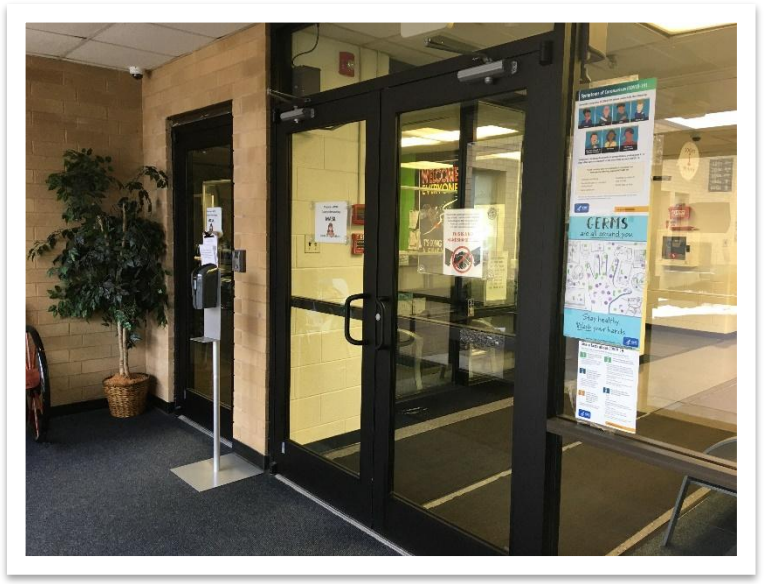
The vestibule mantrap renovation at MTEC involves adding a dividing wall which separates students and visitors.