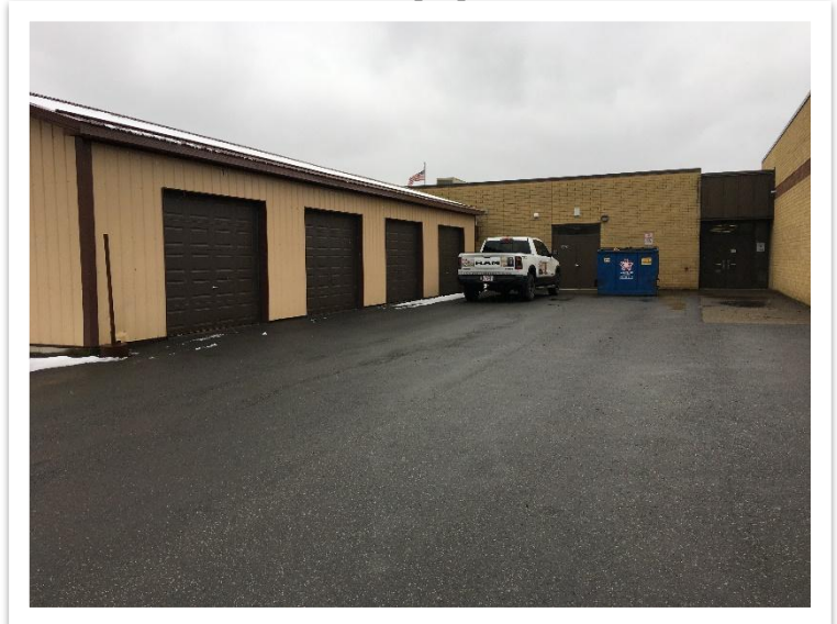
The four-stall metal garage will be removed for the expansion of the proposed addition.