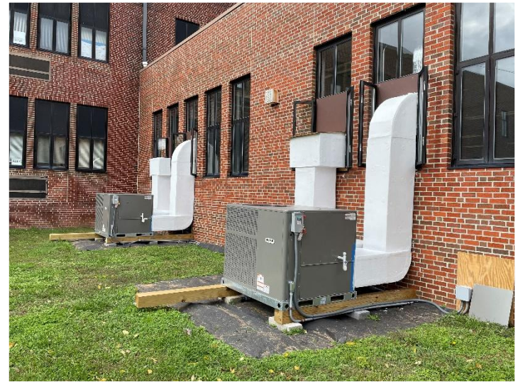
Temporary equipment for air conditioning in the cafeteria of Berkeley Springs High School.