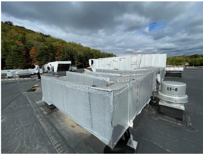
At Widmyer ES, ductwork is exposed to elements and weather protection and insulation is separating and peeling.