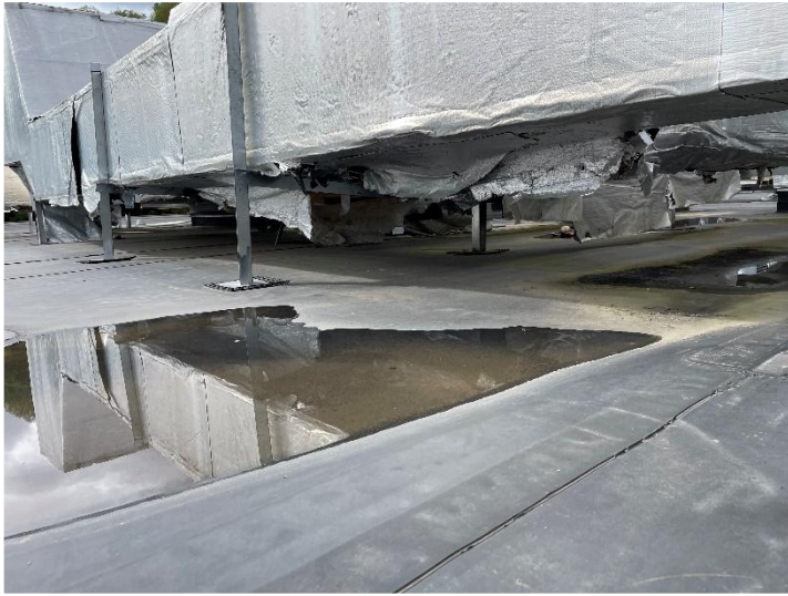
At Widmyer ES, insulation on exterior ducts is peeling which allows moisture to penetrate equipment.