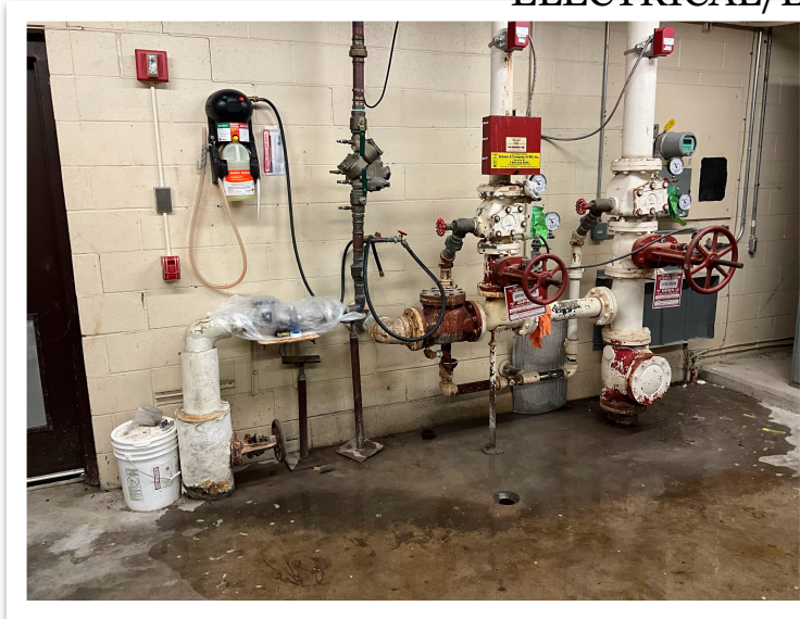
The WV Fire Marshall stated the sprinkler heads and fire suppression system (installed in 1975) need to be replaced.