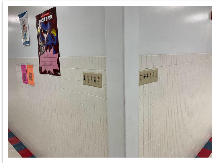
Light switches for their respective classrooms are inconveniently located at the end of each corridor.