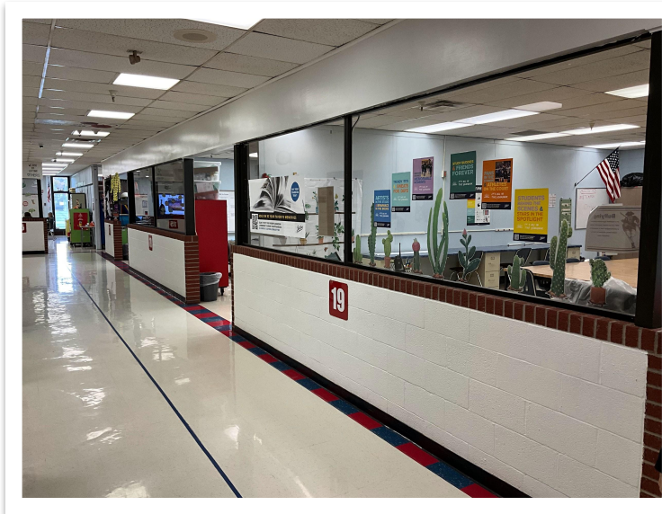
The school was originally designed with an open-classroom configuration. Electrical system components are all original, dating back to 1975.