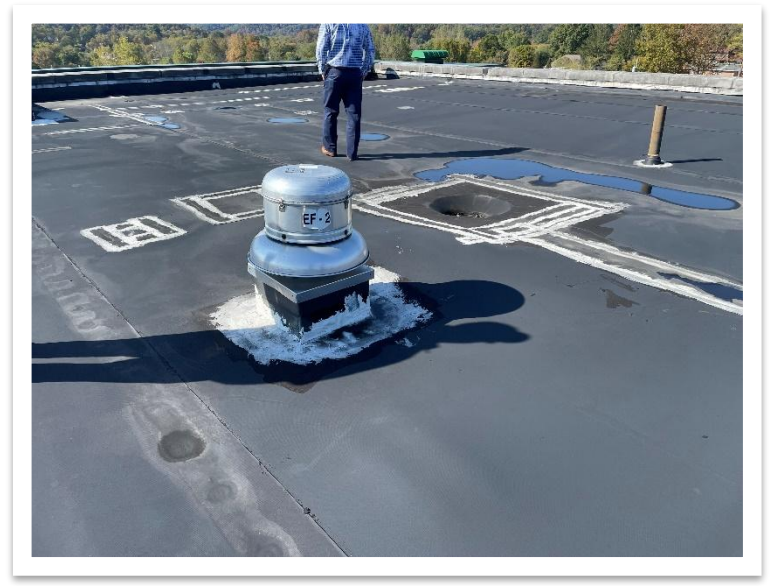
The roof where seams and been patched and reglued.