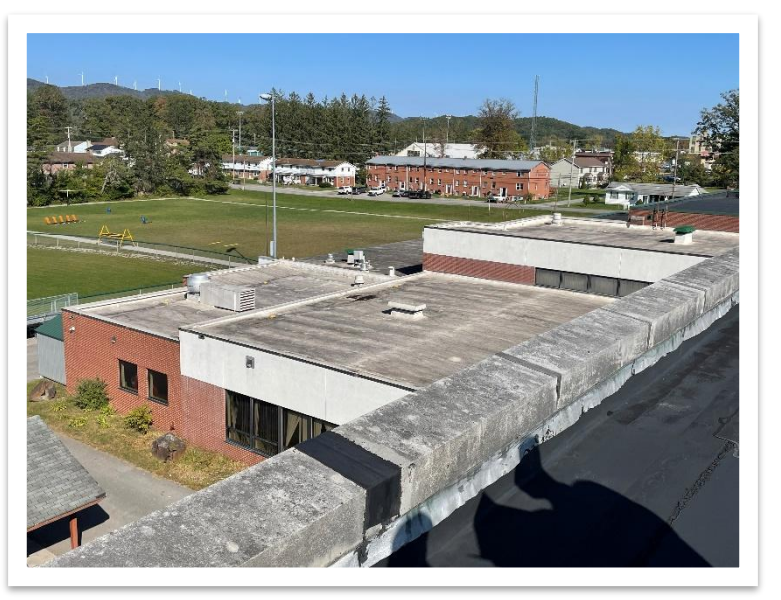
The area of school where sprayed insulation was placed.