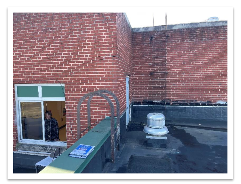
Current access to the roof is on a chair then out a window. Access door to be operational and new ladders on roof.