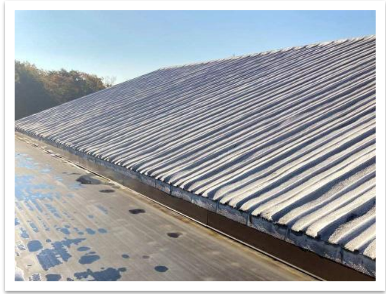
Sprayed insulation roofing on gym that is failing at DTES/MS.