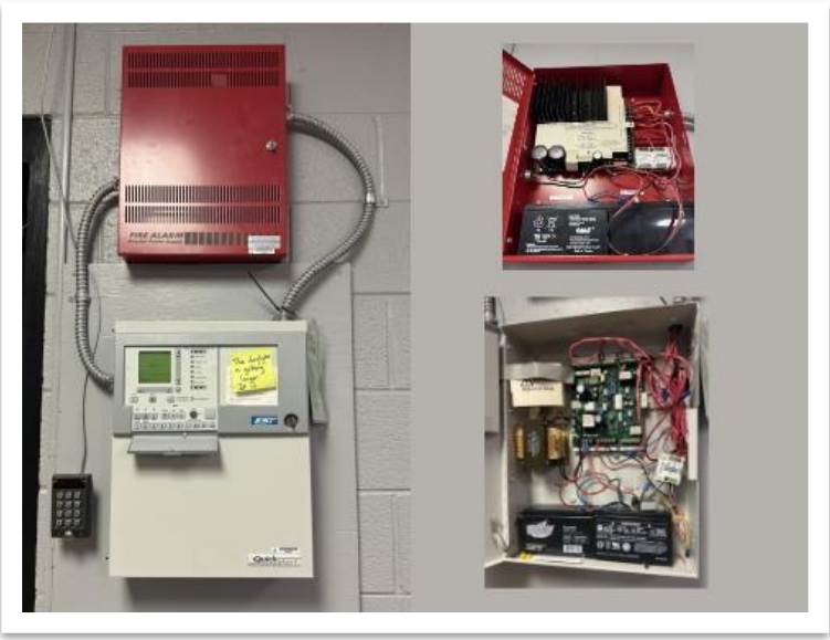
View of aging fire alarm components in the office with panels opened and closed.