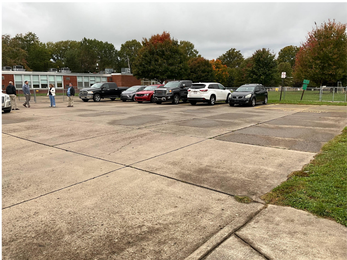
Currently, buses turn around in back of the school in the narrow teacher/staff parking area. Three vehicles have been hit by turning buses.