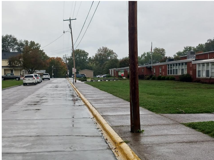
Street backups reportedly occur every morning and afternoon during drop-off/pickup.