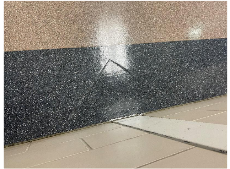
The educational wing with music, art, locker rooms and gym are affected at this time.