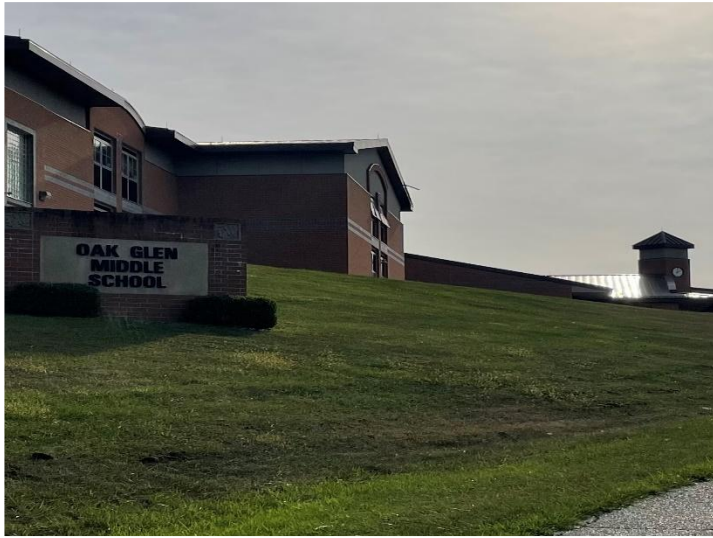
This is an SBA funded facility built in 2005. Pyrite soil issues have been discovered on the east end of building.